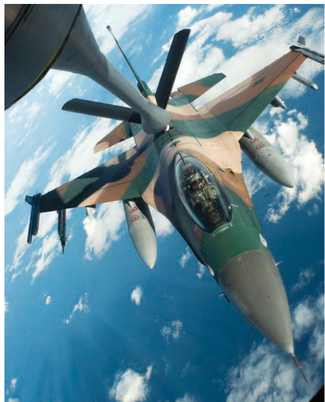
An F-16 from Eielson AFB, Alaska, refuels near Japan.