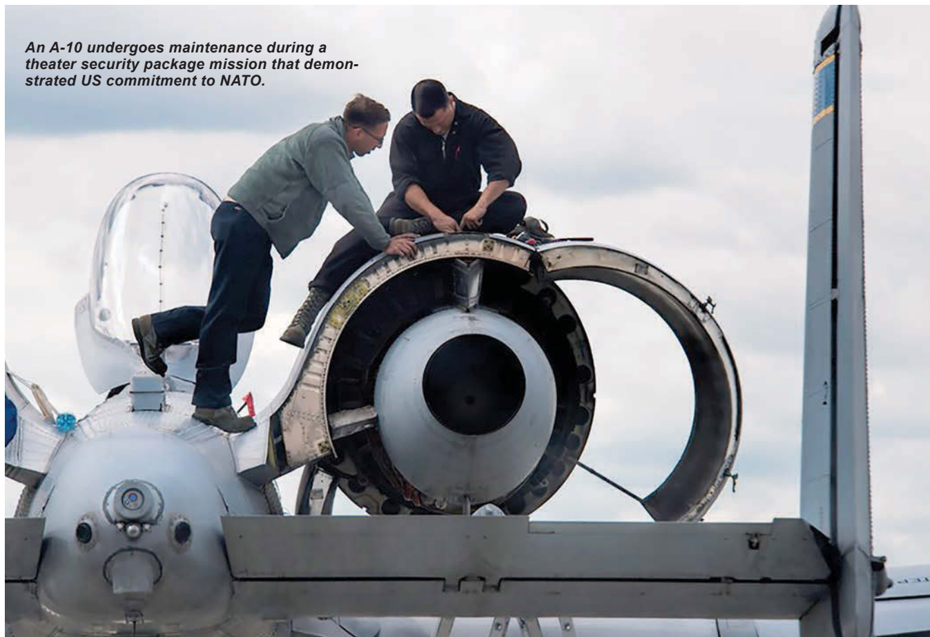
An A-10 undergoes maintenance during a theater security package mission that demonstrated US commitment to NATO.