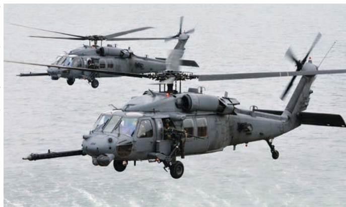
106th Rescue Wing ANG Pave Hawks train off Long Island, N.Y.