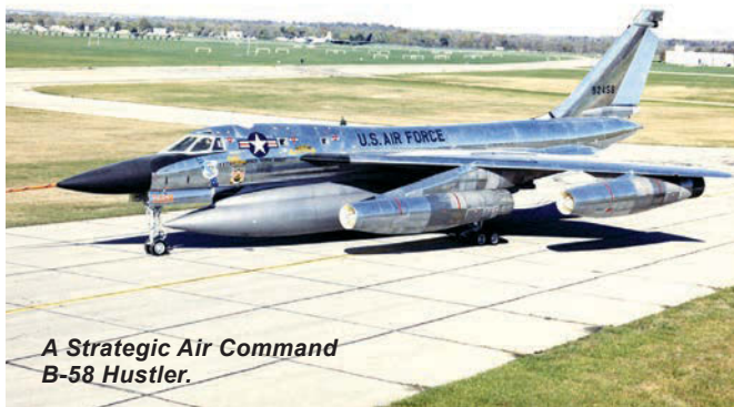
A Strategic Air Command B-58 Hustler.

Newfoundland Base Command, part of Military Air Transport Service, reorganized and redesignated Northeast Air Command, a new major command, Oct. 1, 1950. Inactivated March 31, 1957.