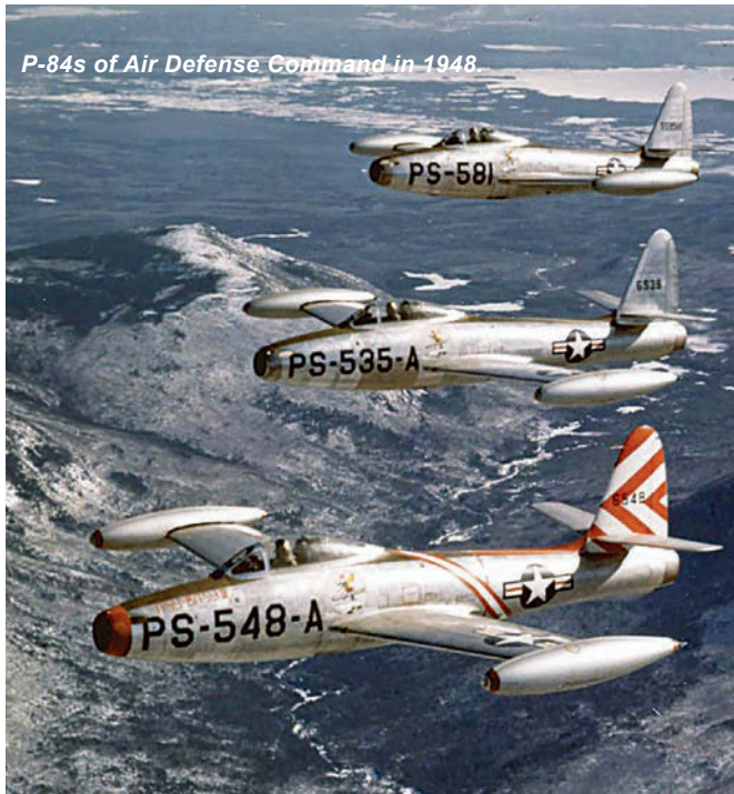
P-84s of Air Defense Command in 1948.