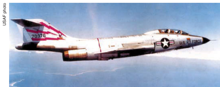
Continental Air Defense Command's forces included assets like this F-101B.

Established December 1961. Disestablished Dec. 31, 1971. Functions assumed by US Readiness Command.